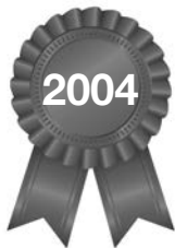
President's Award (Franchisee of the Year)