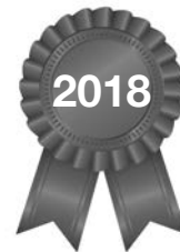
Inspiring Smiles (Franchisee of the Year)