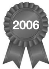
President's Award (Franchisee of the Year)