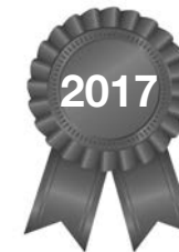
Silver A (Guest Satisfaction)