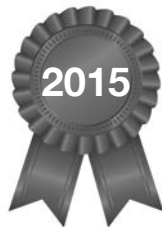
Serve, Refresh, Delight (Superior Performance)