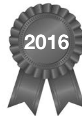
Golden A (Top Performer)