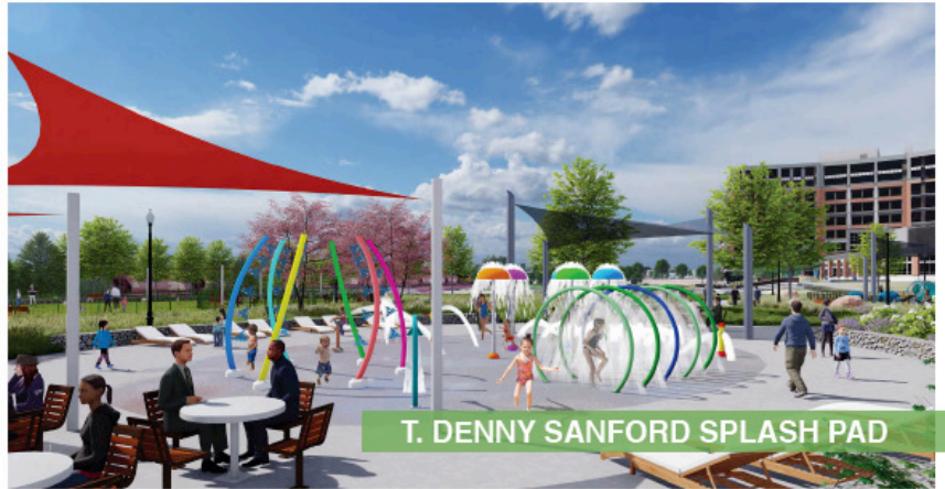
T. DENNY SANFORD SPLASH PAD